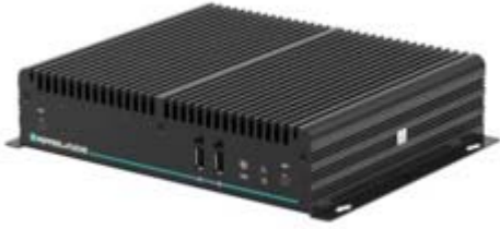
Figure 1: Front view of the BTC14