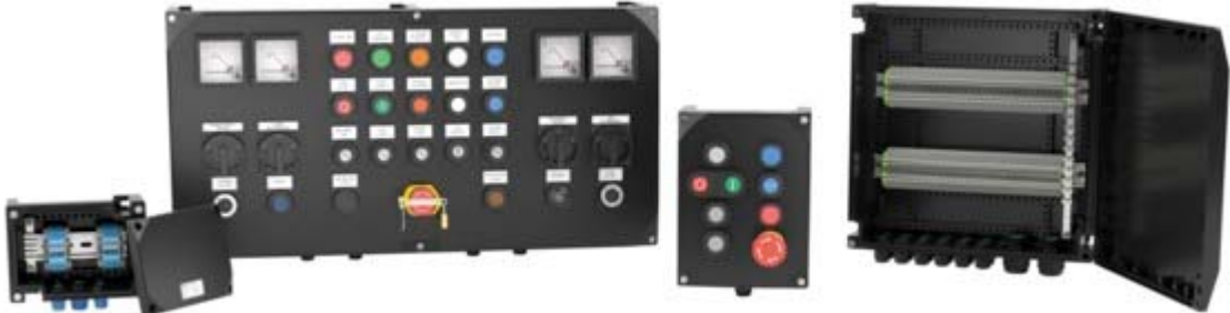
GR enclosure series with type of protection Ex e