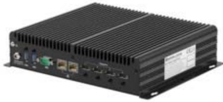
Figure 2: Rear view BTC14