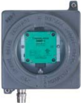
RFID sensor in Ex d enclosure